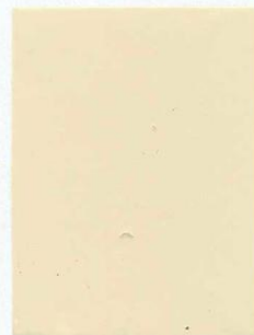
Autumn Stone 0128