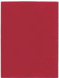
Tile Red 0113