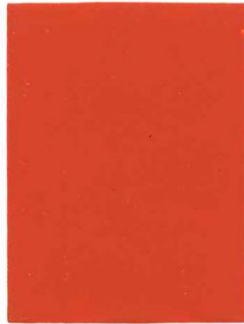
Spicy Orange 0171