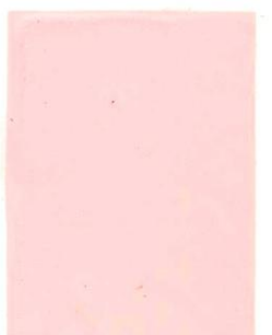
New Diamond Pink 0251