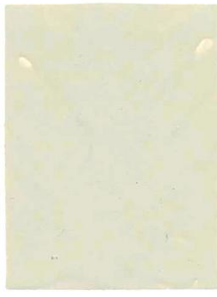
Pottery Clay 0160