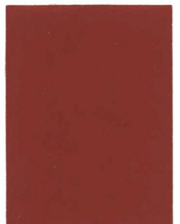
Brick Stone 0168