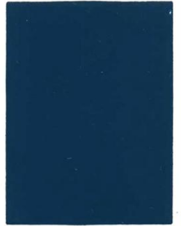
Navy Blue 0177