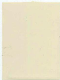
Sea Shell 0116