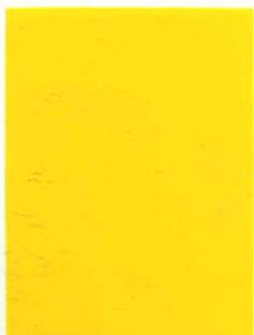
New Corn Yellow 0248