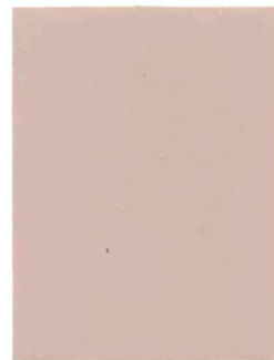
Tea Rose 0112