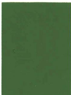
New Spring Leaf 0240