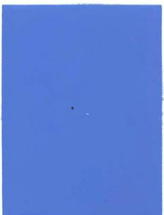
New Phlox 0243