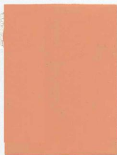
Dusky Sun 0156