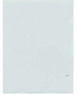
Sky Grey 0124