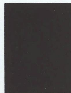
Charcoal New 0134