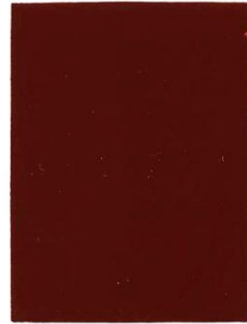
Red Oxide 0119